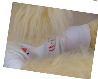
Even GT wore a PANCA T-Shirt